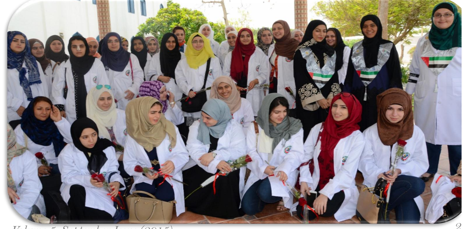
Volume 5: September Issue (2015)

Following this top achievers from DPC and DMC addressed the students with a motivational speech. The ceremony was followed with a luncheon for all the faculty, staff and students of DPC and DMC.