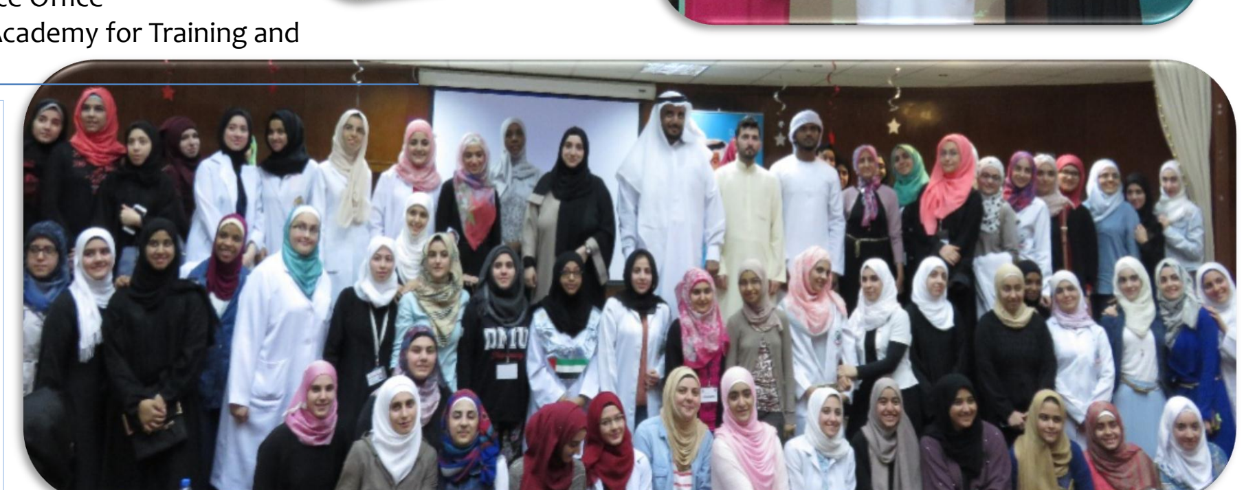
Volume 5: October Issue (2015)