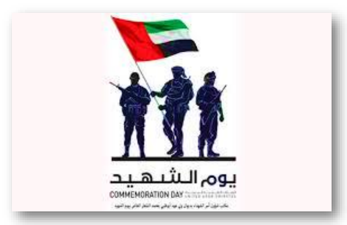
DPC pays tribute to the country's martyrs' by observing a minute of silence and prayers