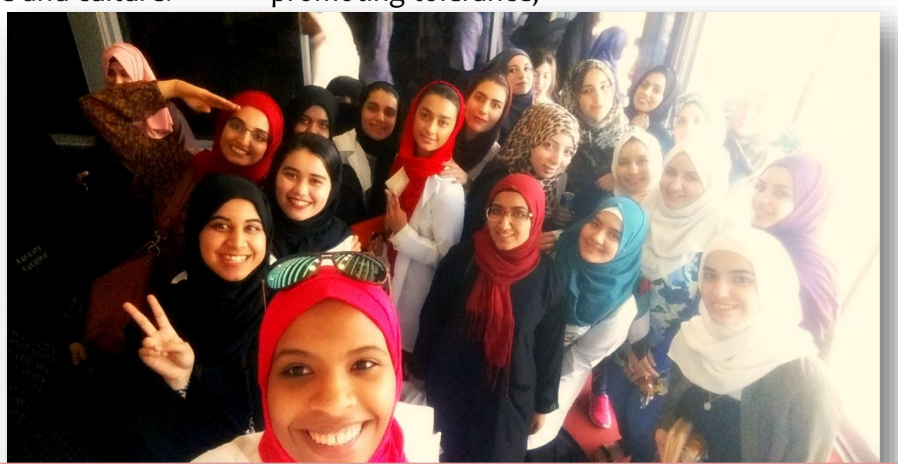
DPC students visited Sharjah International Book Fair during 2-12 Novemebr, 2016

doctor or engineer. A society of readers is an advanced society, openminded to the surrounding world. Our goal is to make the UAE a beacon of knowledge and education, just as Baghdad, Andalusia, Granada and others were