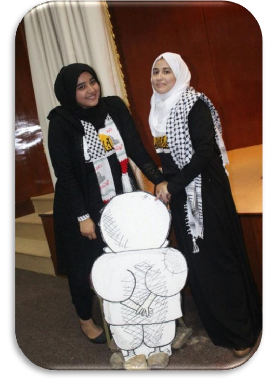
Volume 5: November Issue (2015)