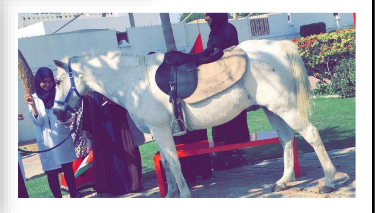
DPC and DMC celebrate the UAE National Day