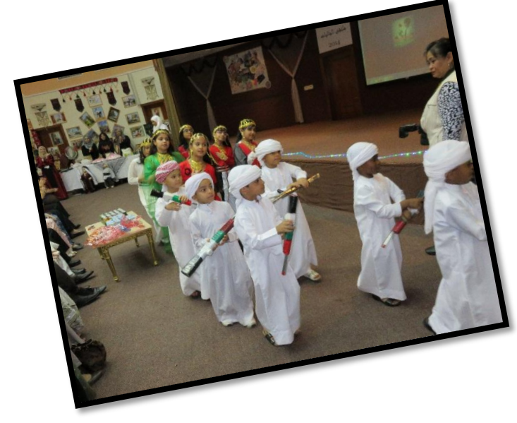
The traditional Emirati 'Yeola' dance