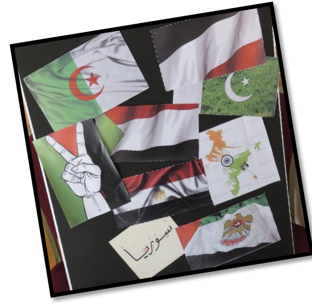
Unity in Diversity

The main attractions included stalls representing each country followed by cultural performances. The Dean inaugurated the event. It was a fun filled day with performances which included traditional dances by all participating countries and the students did a wonderful work.