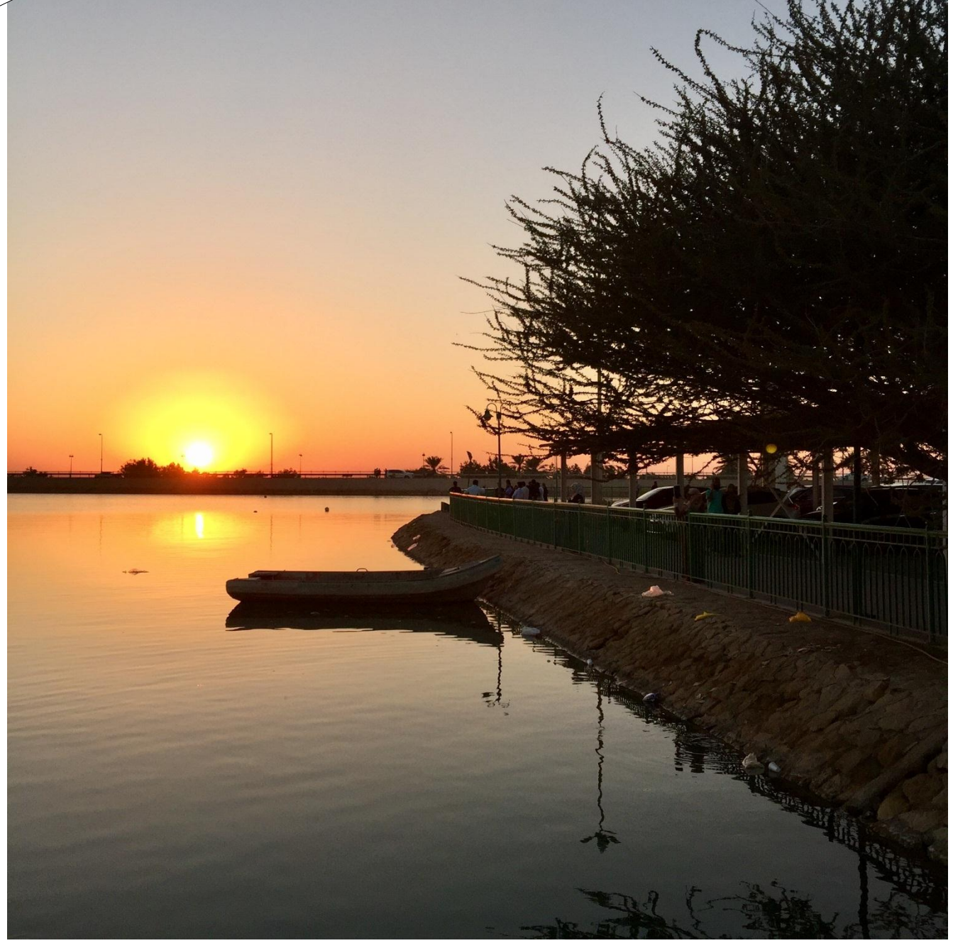
Hajara Sharafuddeen (Batch 22)