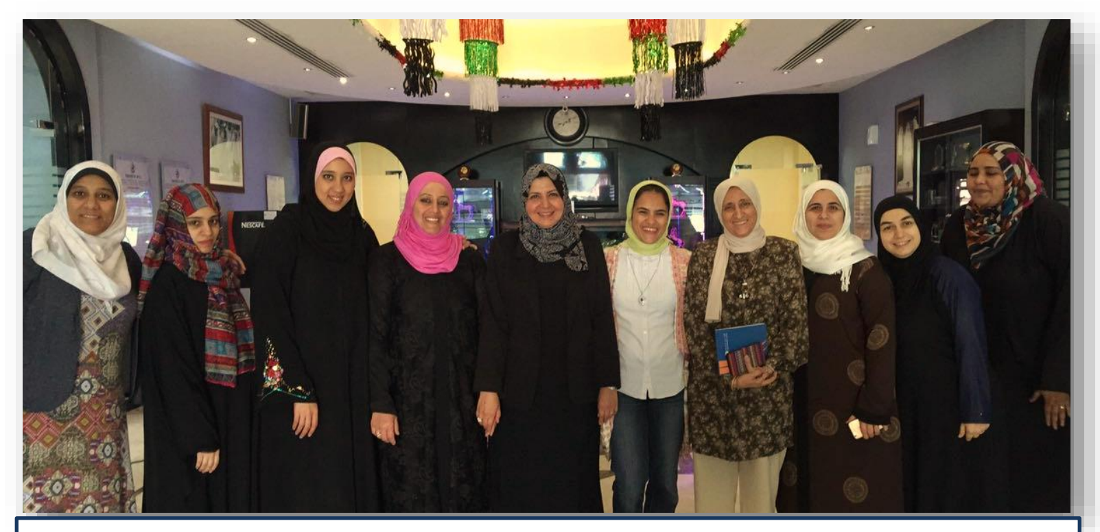
"The energy of the mind is the essence of life."