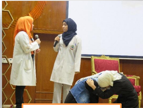
Play 1; "I Care For You".