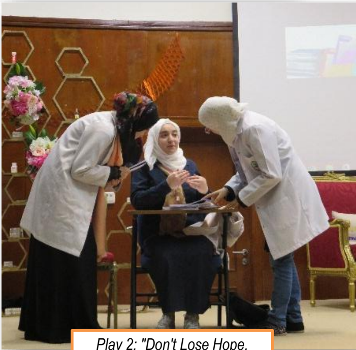
Play 2; "Don't Lose Hope, Pharmacy Is the Top".