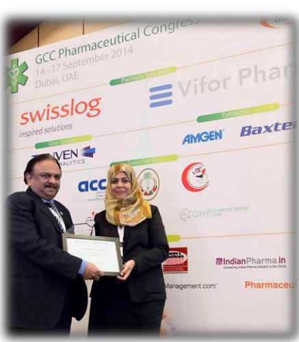
Dubai Pharmacy College rejoices the moment.....!!!