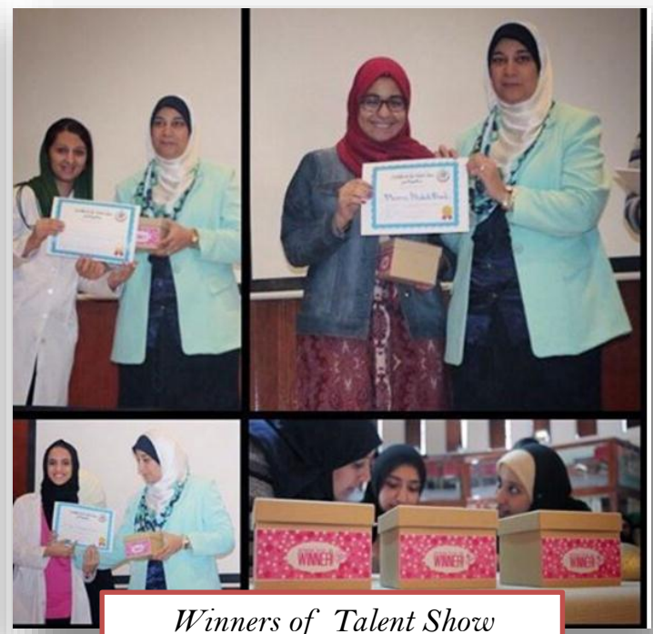
Winners of Talent Show