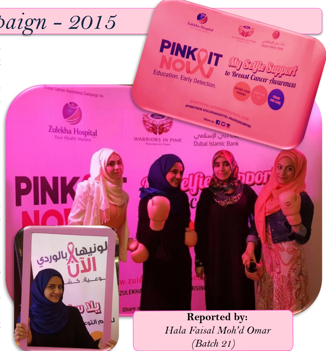
Reported by: Hala Faisal Moh'd Omar (Batch 21)

https://www.wam.ae/en/news/emirates/1395286294919.html