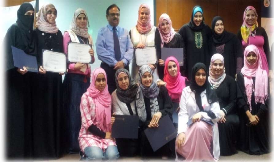
With the Dean, Heads and Members of 2011-12

Have a suggestion or comment ? Post it to < DPCnewsletter@dpc.edu >.