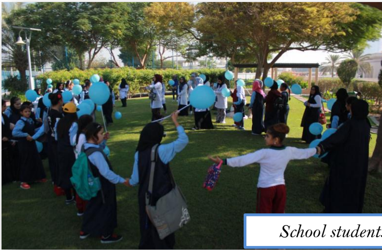
School students at Al Sufouh Park