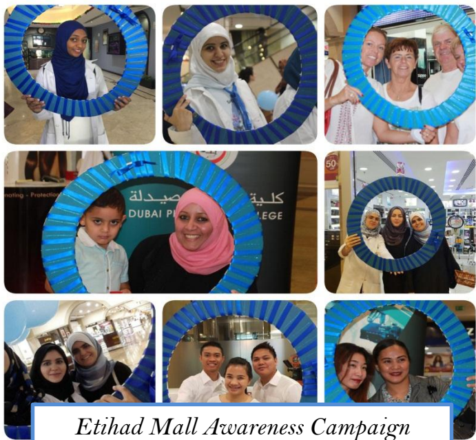
Etihad Mall Awareness Campaign