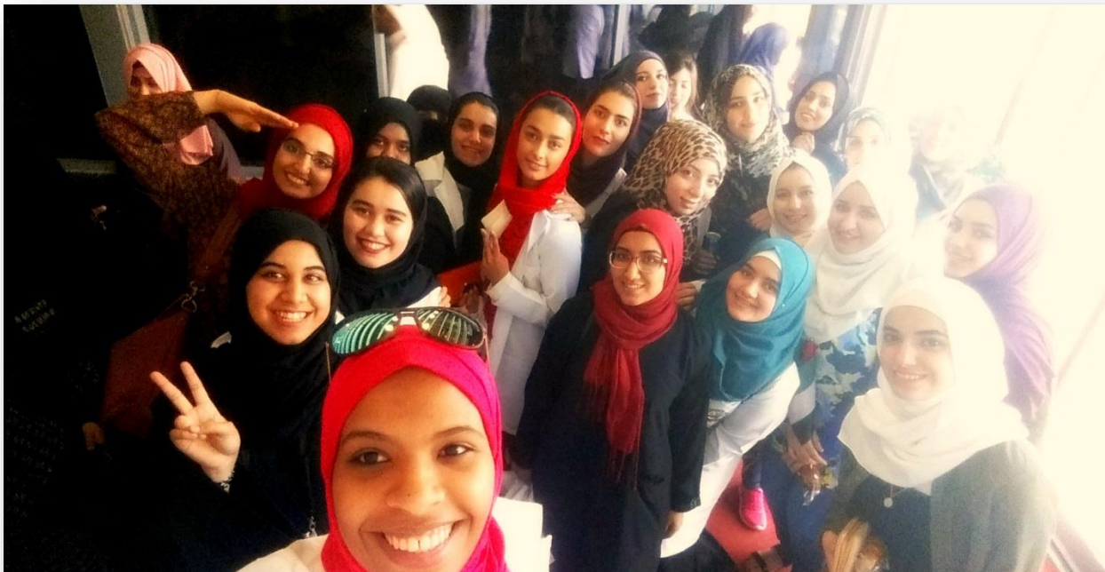
DPC students visited Sharjah International Book Fair during 2-12 Novemebr,2016

doctor or engineer. A society of readers is an advanced society, open-minded to the surrounding world. Our goal is to make the UAE a beacon of knowledge and education, just as Baghdad, Andalusia, Granada and others were