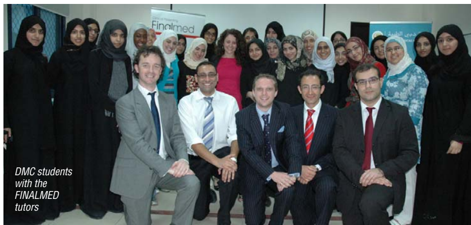
DMC students with the FINALMED tutors