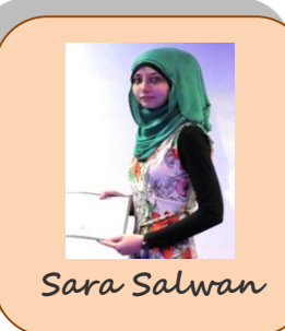
Rank 1 CGPA: 4 98.19%